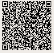
Centrona Zest A P51800003446

Site address: L&T Realty 77 CROSSROADS, Eastern Express Highway, Near Ghatkopar Jeejaabai Flyover, Ghatkopar East, Mumbai-400 077. Contact No.: 99025 99025 | E-mail: homes@larsentoubro.com Website: www.Lntrealty.com