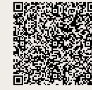
Centrona Zest B P51800003201